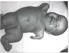
A Teratogenic Substance called Thalidomide caused this... Alcohol is also Teratogenic

DEFINITION: FASD is an umbrella term for a range of physical and mental effects caused by alcohol taken by a woman during pregnancy and breastfeeding.