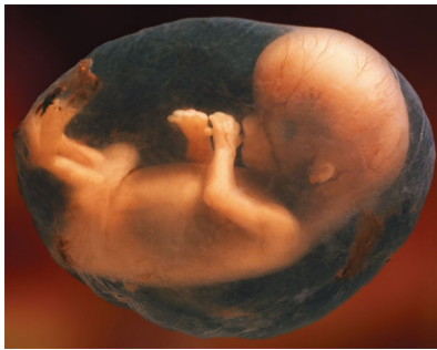
Fetus in Amniotic sac is vulnerable to Alcohol ...

The ONLY way to prevent FASD is to abstain from alcohol. This is the safest option because in many cases of pregnancy the mother is unaware that she is pregnant for the first trimester. Best practice is to avoid all alcohol if you are planning to get pregnant, or not using contraception. Drinking alcohol during this period may cause FASD.